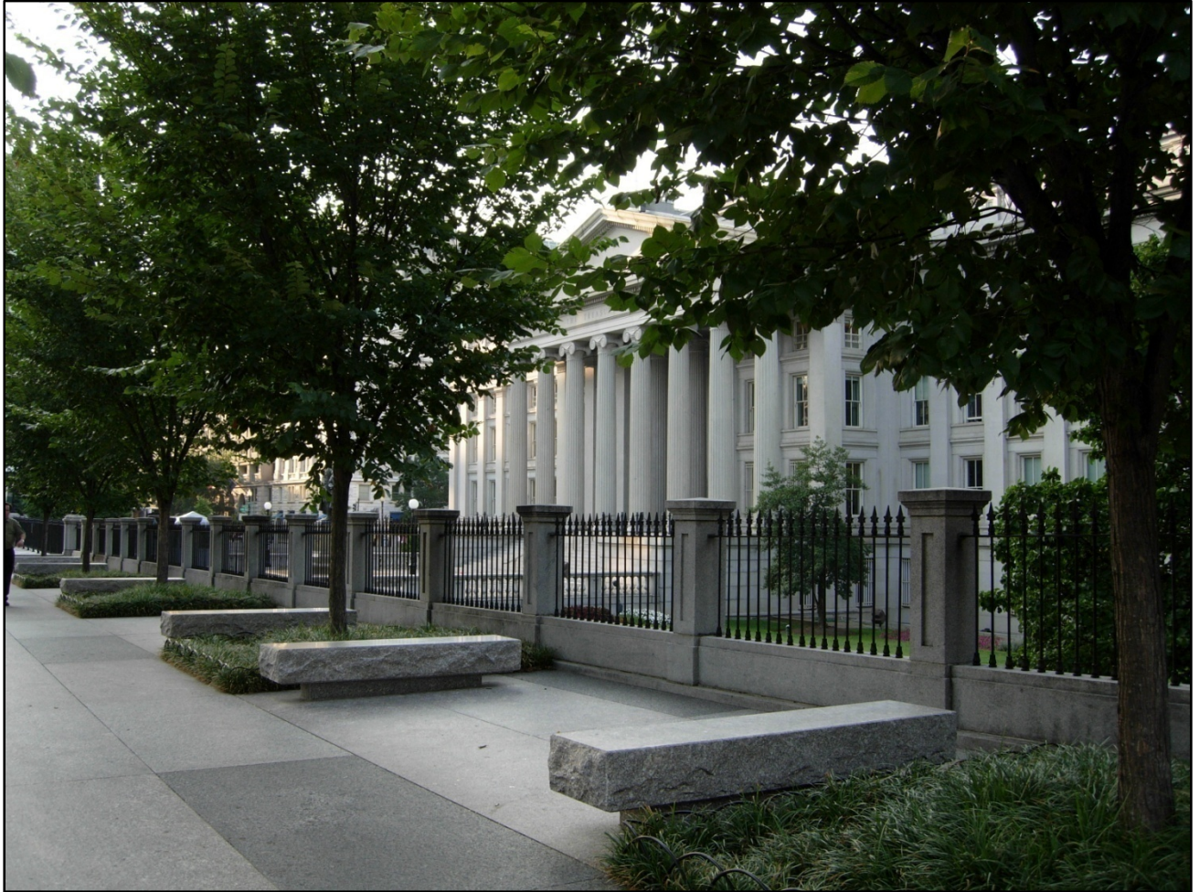
North side of the Treasury Building, Washington, DC