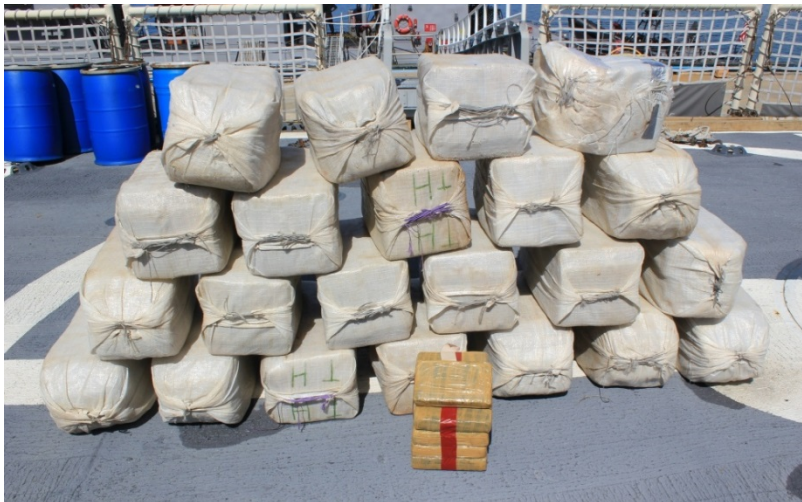
Figure 4: Bales of cocaine are shown on the deck of the Coast Guard Cutter Vigorous May 30, 2016, in the Atlantic Ocean.

The Vigorous crew conducted seven additional at-sea boardings, detaining nine suspected drug smugglers, and stopping 26 metric tons of cocaine, with a wholesale value of more than $373 million, from reaching the United States. The Vigorous also rescued three survivors who were found adrift in their vessel more than 200 nautical miles from the nearest point of land.