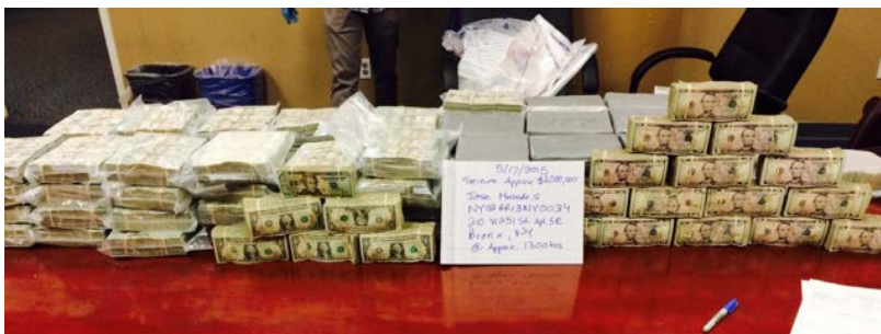
Figure 2: $2,027,643 in seized currency.

Based on information from a variety of sources, five search warrants were obtained for the addresses associated with the drug trafficking organization (DTO) in anticipation of a large shipment arriving. On May 17, 2015, a known leader of the DTO parked in front of the stash location and was approached by members of HSI New York and DEA New York. In plain sight on the passenger's seat was a small bag of heroin, which resulted in an arrest. The search warrants were subsequently executed, resulting in the discovery of approximately $2,027,643 in bundled U.S. currency hidden in a floor trap in a bedroom in the stash location. Additionally, approximately 70 kilograms of heroin were seized from a hidden compartment located in a vehicle belonging to the individual.