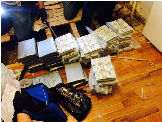
Figure 1: Currency discovered hidden beneath the floorboards.

On May 17, 2015, HSI agents in New York seized over $2 million in currency from a heroin trafficking organization. The case had begun in September of 2012, when HSI agents who were part of the El Dorado Task Force (EDTF), in conjunction with US Drug Enforcement Administration (DEA) agents, initiated a money laundering/drug trafficking investigation of heroin traffickers operating in the Bronx, NY area.