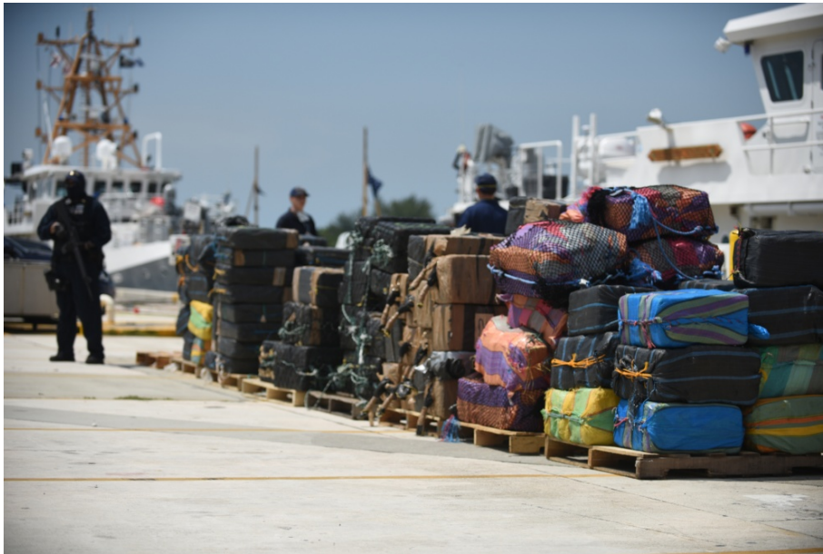
Figure 3: Approximately eight tons of seized cocaine offloaded from Coast Guard Cutter Bernard C. Webber to Coast Guard Base Miami Beach on June 13, 2016.

The drugs were interdicted in international waters of the Eastern Pacific Ocean drug transit zone off the coast of Central and South America.