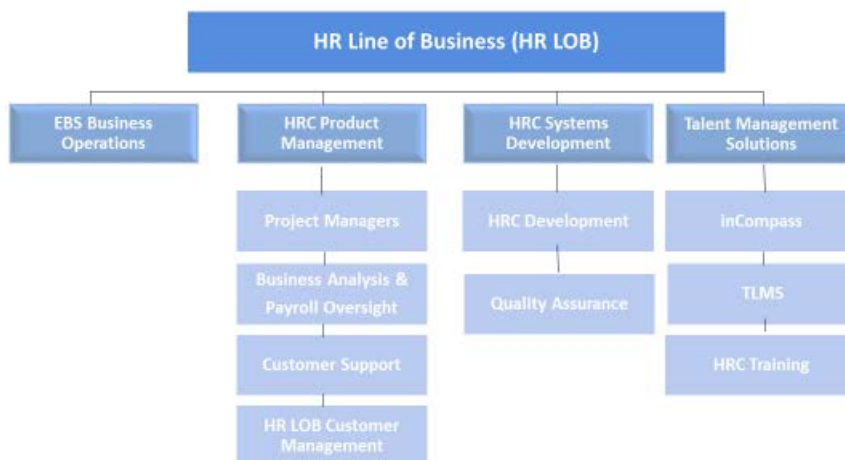
Figure 1: HRConnect Products and Services