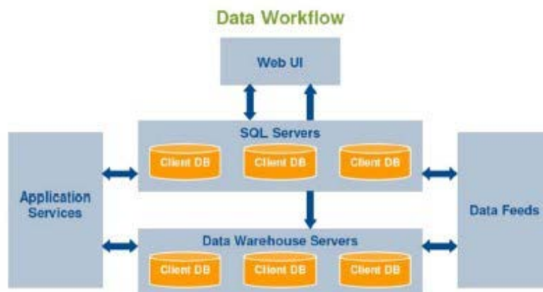
Figure 3: HRConnect Workflow