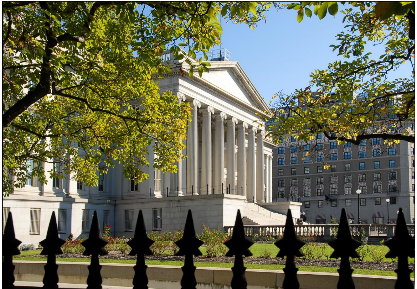
South Side of the Treasury Building in Washington, DC