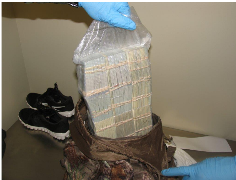
Figure 2: Currency concealed in a backpack.

Border Patrol agents arrested the two individuals for their illegal entry into the United States. A search incident to arrest yielded varying denominations of U.S. currency totaling $373,986. Both subjects were presented for prosecution under 8 U.S.C. § 1326 (Re-Entry after Deportation). The currency was administratively forfeited in March 2014.