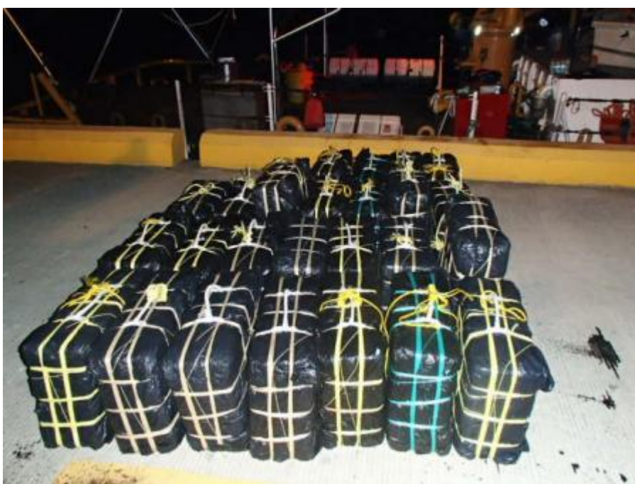
Figure 3: Twenty-five bales of cocaine weighing 2,546 pounds and with an estimated wholesale value of $34 million.

The drug shipment is estimated to have a wholesale value of more than $34 million dollars.