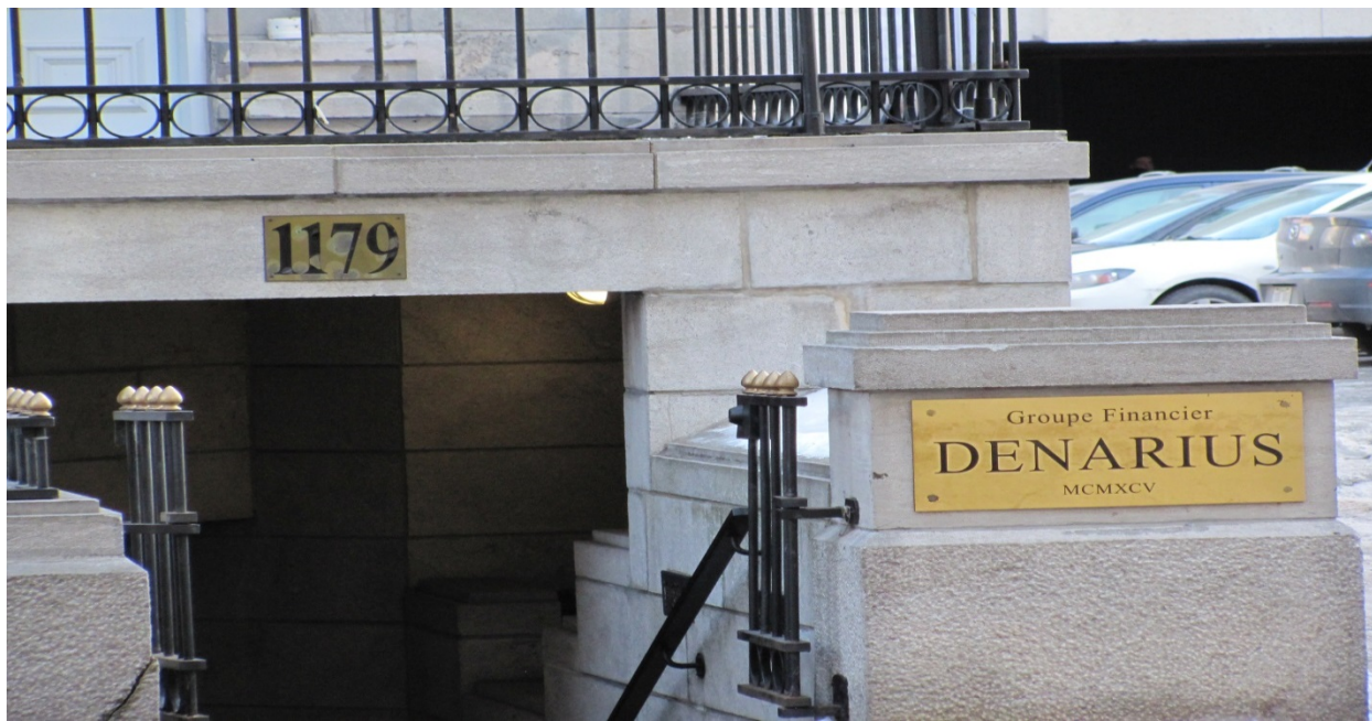
Figure 1: Denarius Financial Group processed payments for illegal gambling sites.

Information included in the following forfeiture article was provided by the USSS Liaison to TEOAF.