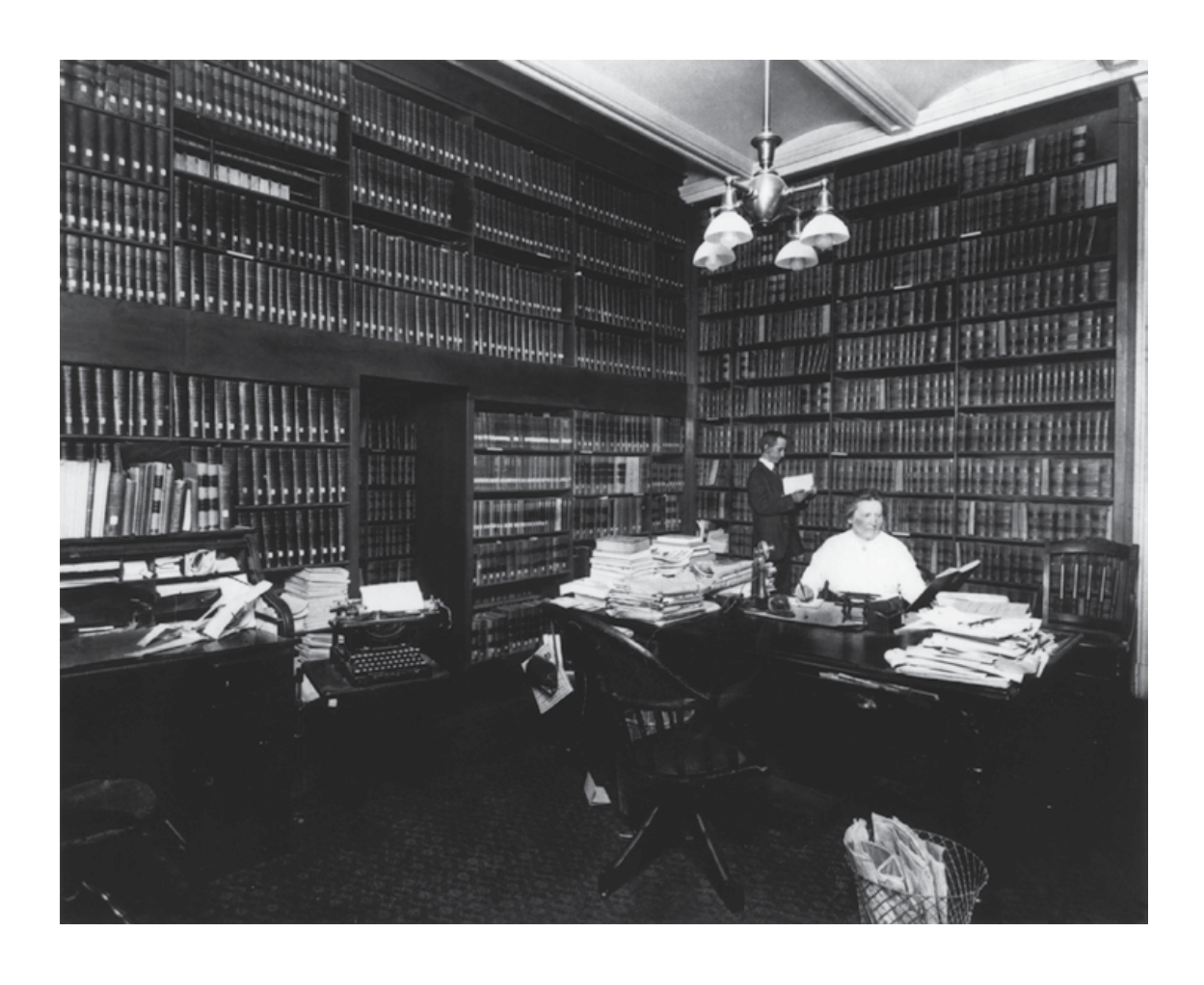
Reference Library, c.1915