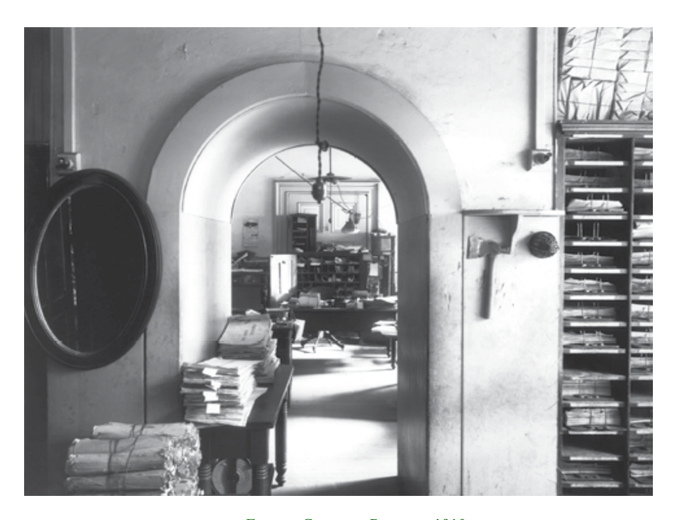
Express Company Room, c. 1910