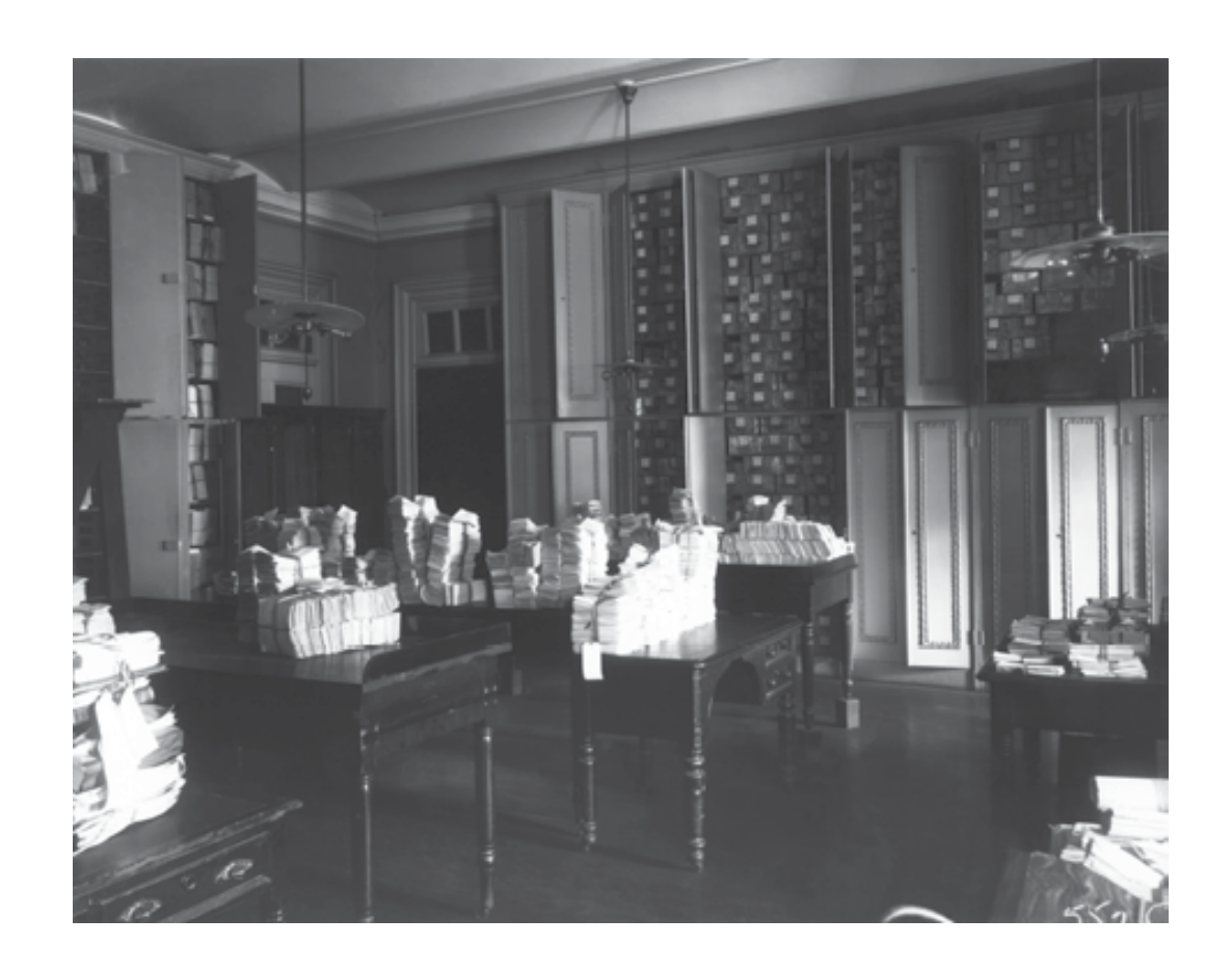
Auditor of the Treasury, c. 1910